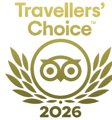
Best of the Best Tripadvisor 2022 to 2026