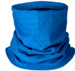
Buff or bandana