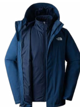
Waterproof and windproof jacket