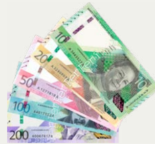
Peruvian soles cash