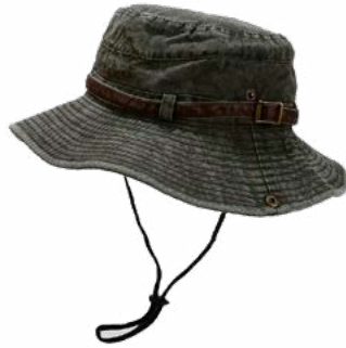
Sun hat or cap with neck cover

Your daypack should hold only what you'll use while hiking. Focus on hydration, weather protection, and personal items you want within reach. Keep it light and easy to access, so you can walk comfortably without stopping to dig for things.