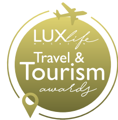
Premios LuxLife 2025