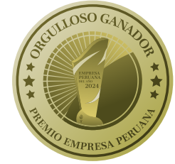
Empresa Peruana del año 2024