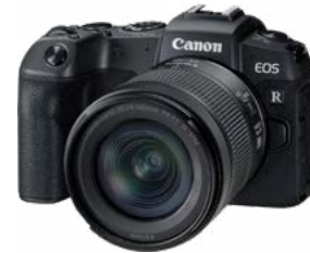
Camera + extra batteries