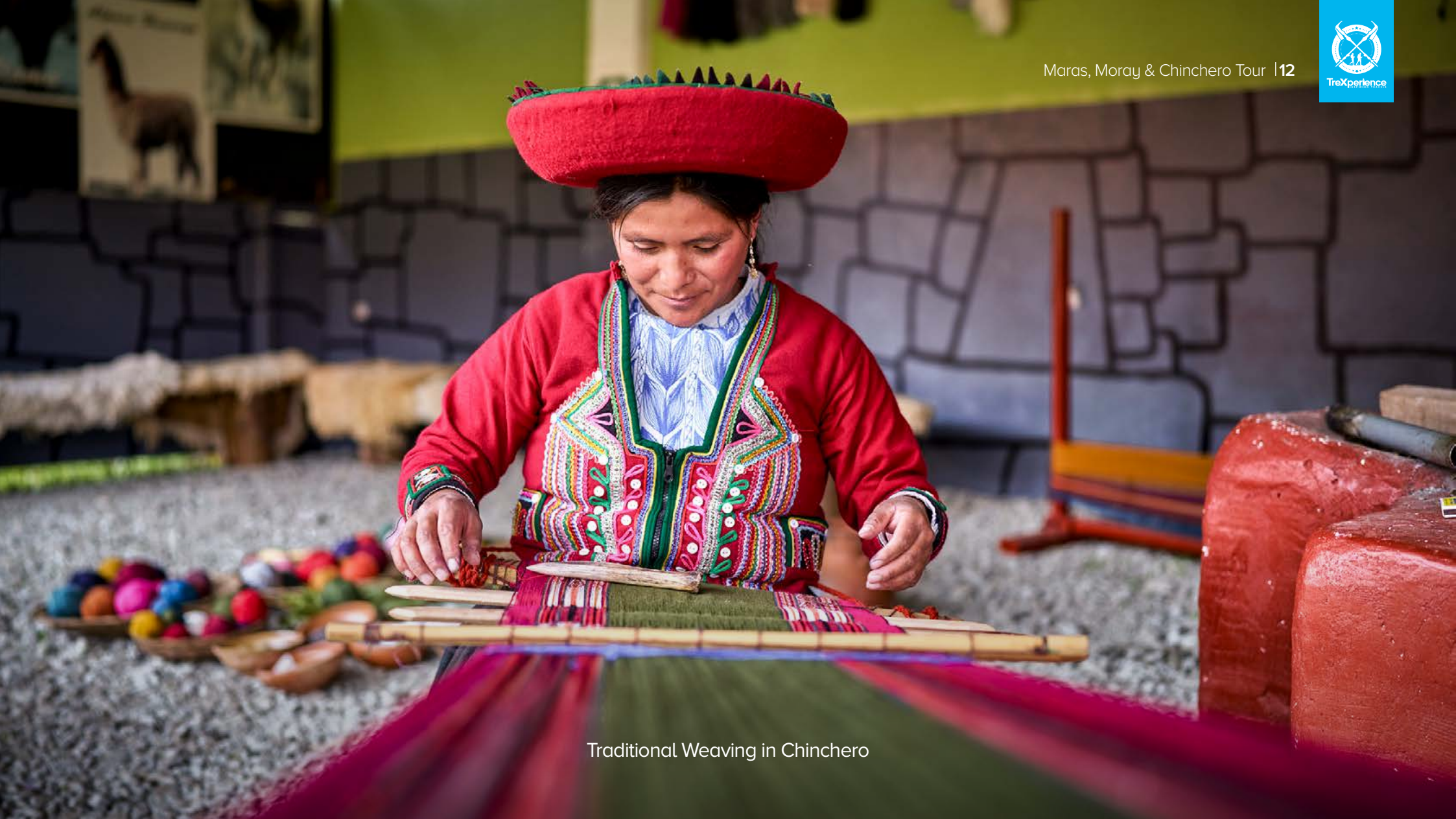
Traditional Weaving in Chinchero