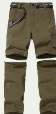
Hiking pants/ trousers