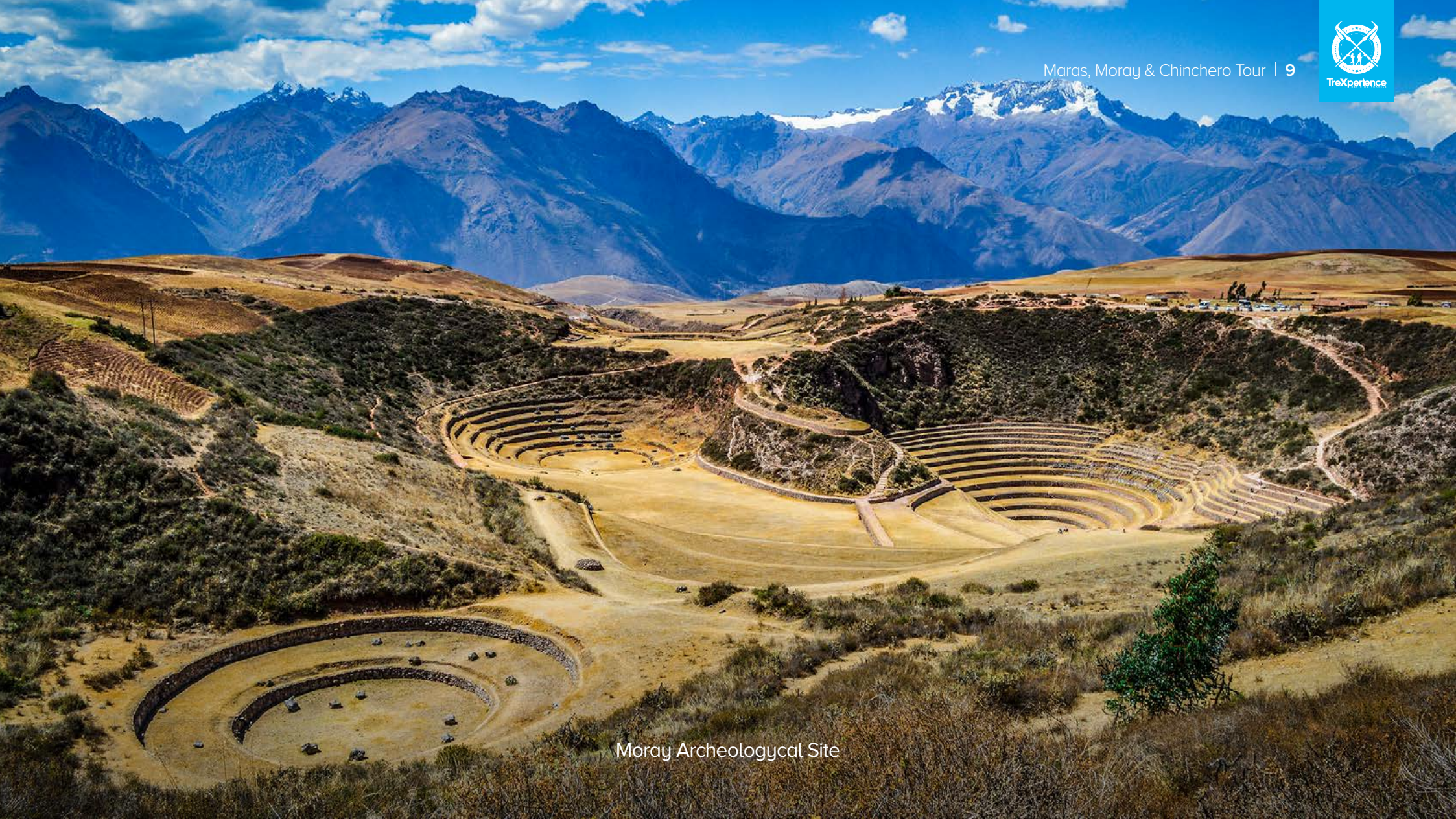
Moray Archeological Site