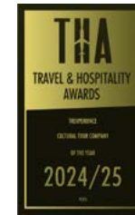
Travel & Hospitality Awards 2025