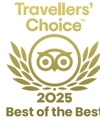
Best of the Best Tripadvisor 2022 to 2025