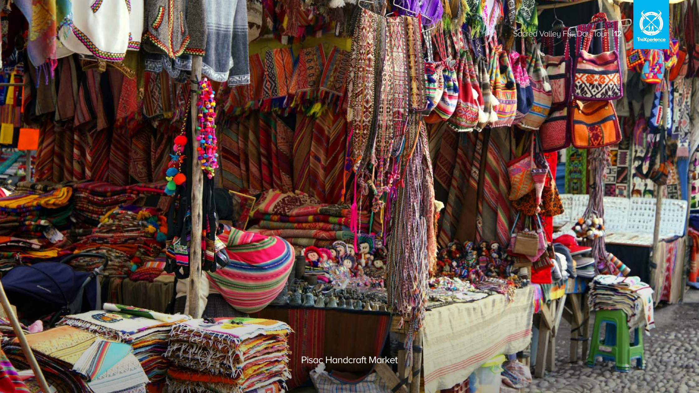
Pisac Handcraft Market