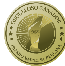
Empresa Peruana del año 2024