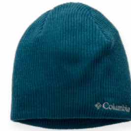
Beanie or chullo