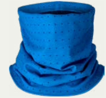
Buff or bandana