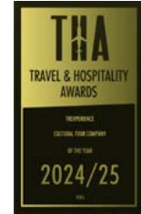
Travel & Hospitality Awards 2022