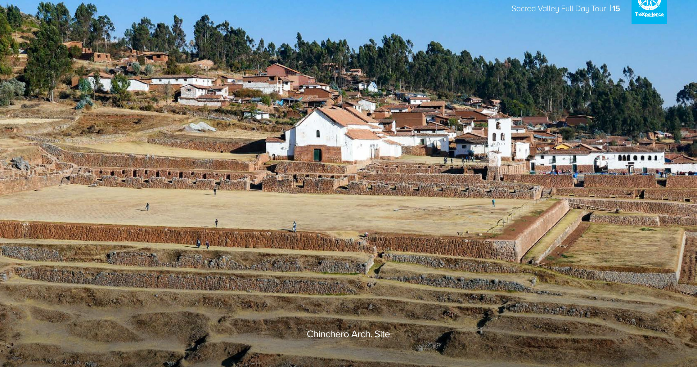
Chinchero Arch. Site