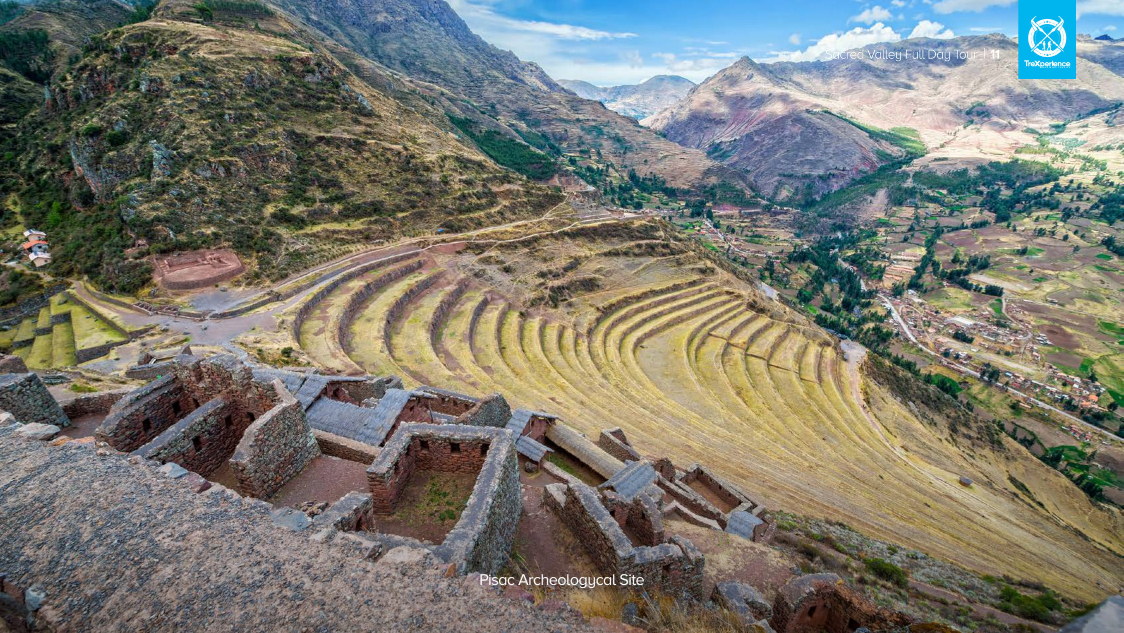
Pisac Archeological Site