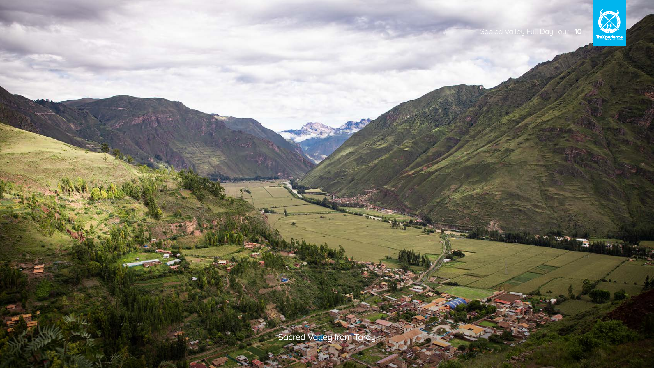
Sacred Valley from Taray