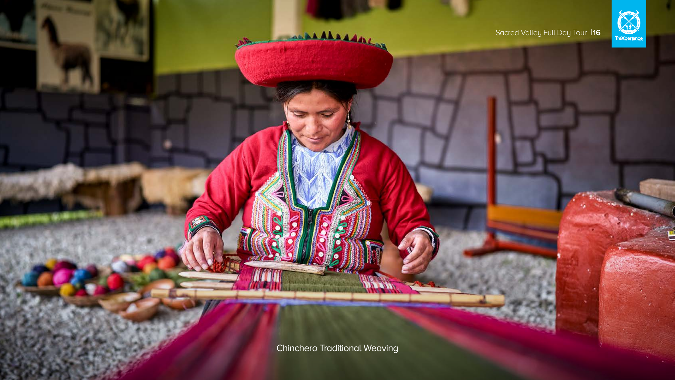
Chinchero Traditional Weaving