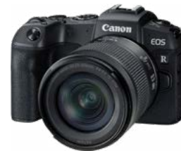
Camera + extra batteries