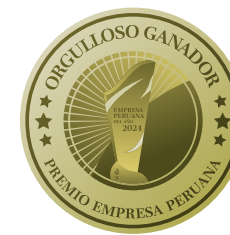
Empresa Peruana del año 2022