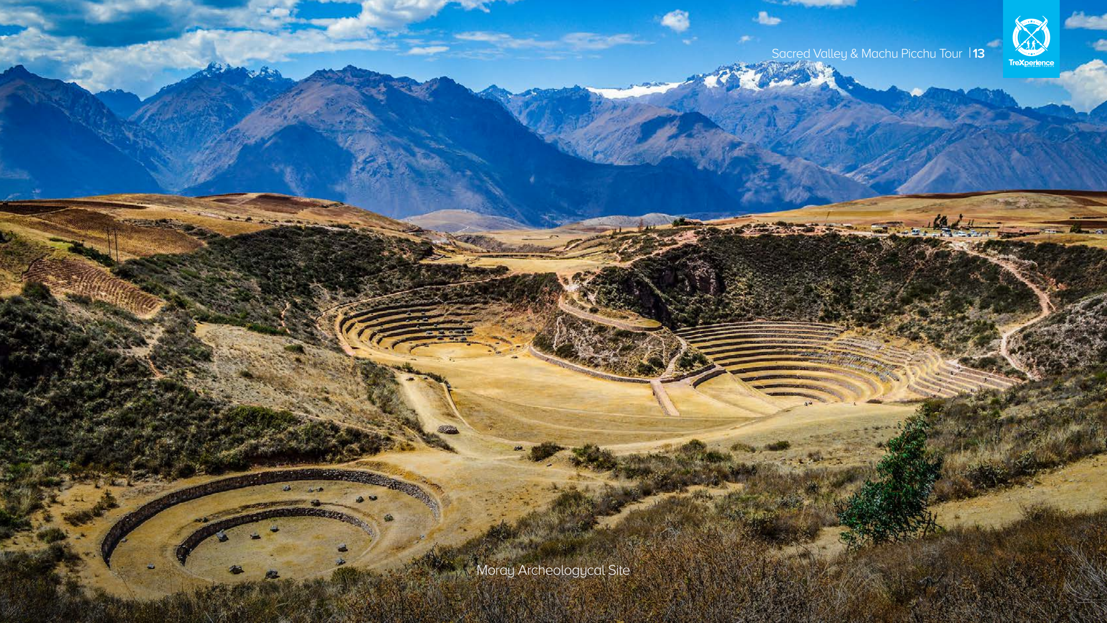
Moray Archeological Site