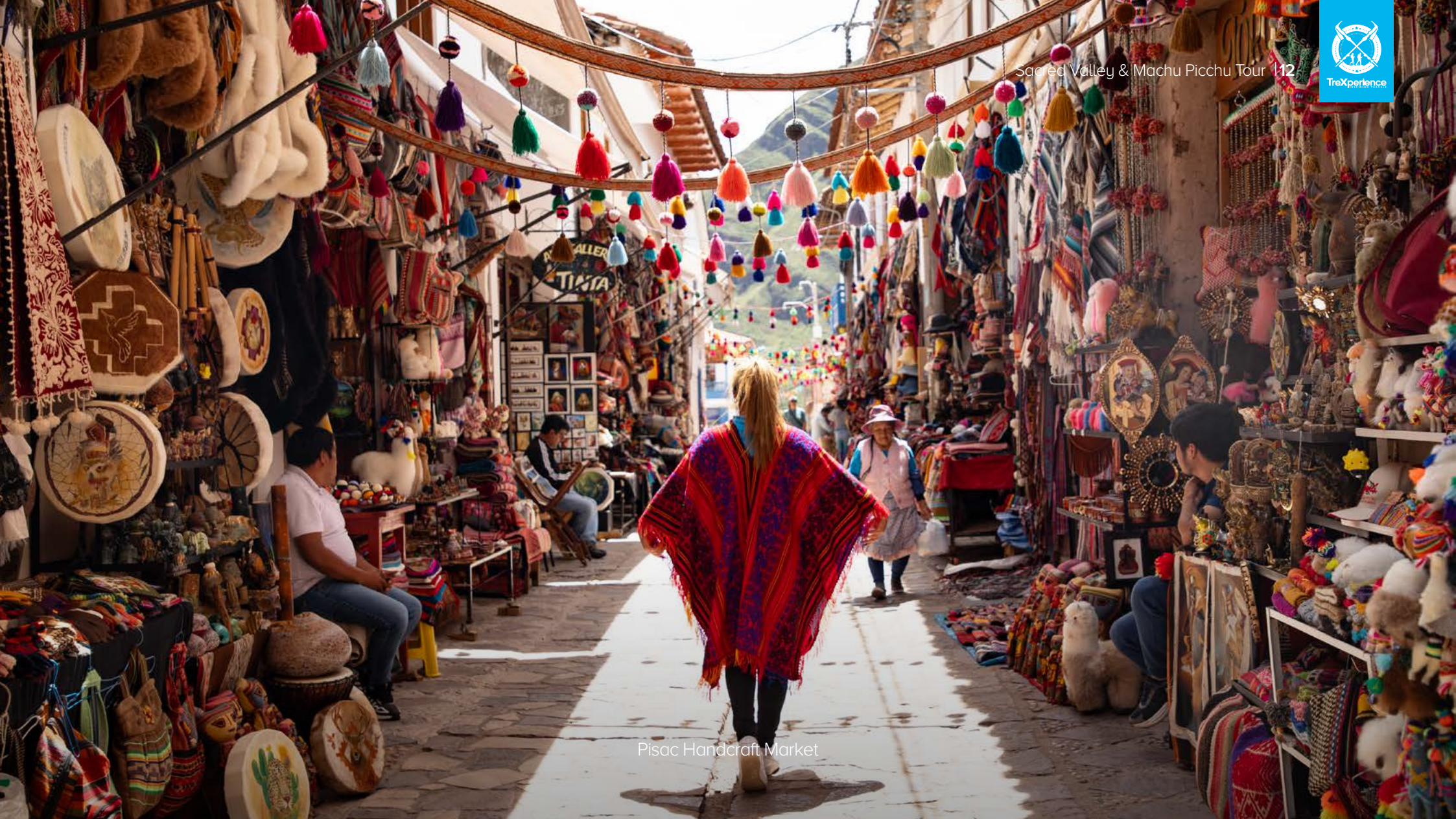
Pisac Handcraft Market