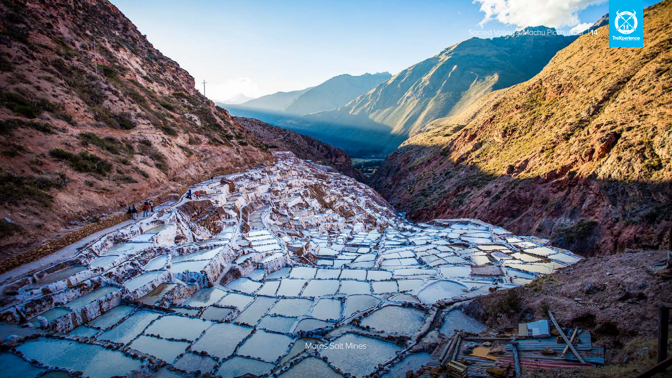
Maras Salt Mines