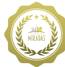
Premio Miradas 2022