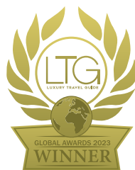
Luxury Travel Guide Global Awards 2023