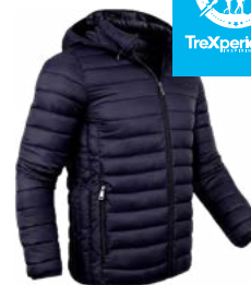
Insulated or fleece jacket

Insulated jacket for colder mountain nights.