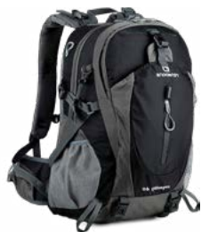
Backpack (25- 40L)

When preparing for the Sacred Valley & Short Inca Trail Hike to Machu Picchu, it's important to pack properly for the altitude, cold weather, and rugged terrain. Here are some essential items you should bring: