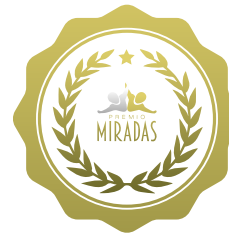
Premio Miradas 2022