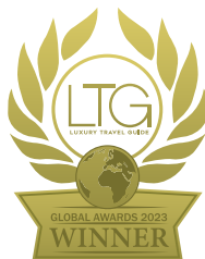
Luxury Travel Guide Global Awards 2023