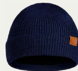
Wool hat or Beanie

Hiking boots that fit, with strong, grippy soles.