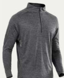
Upper warm clothes

Durable backpack for essentials and hydration.