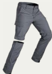
Trekking pants (2 pairs)

Insulated jacket for colder mountain nights.