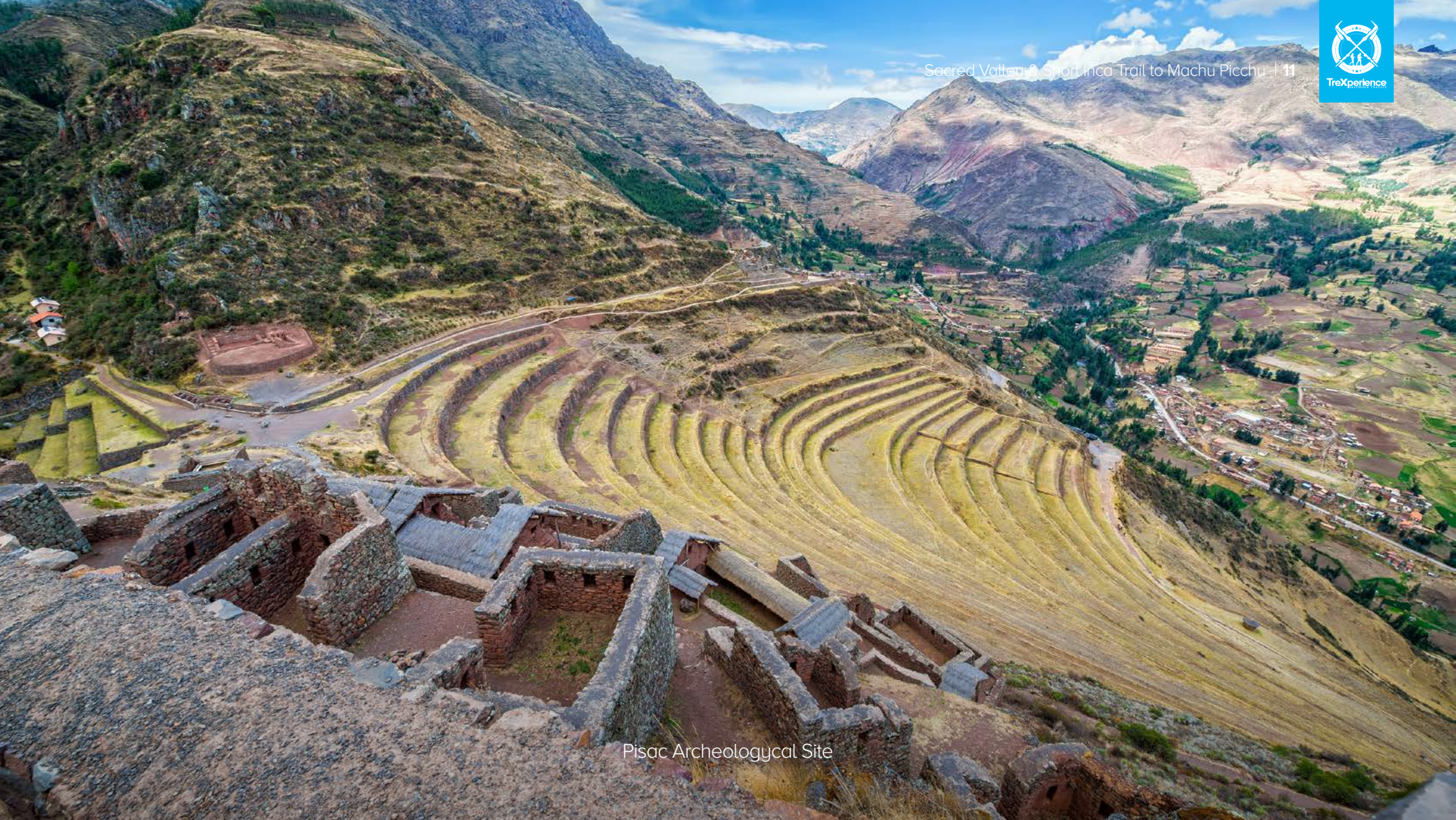
Pisac Archeological Site