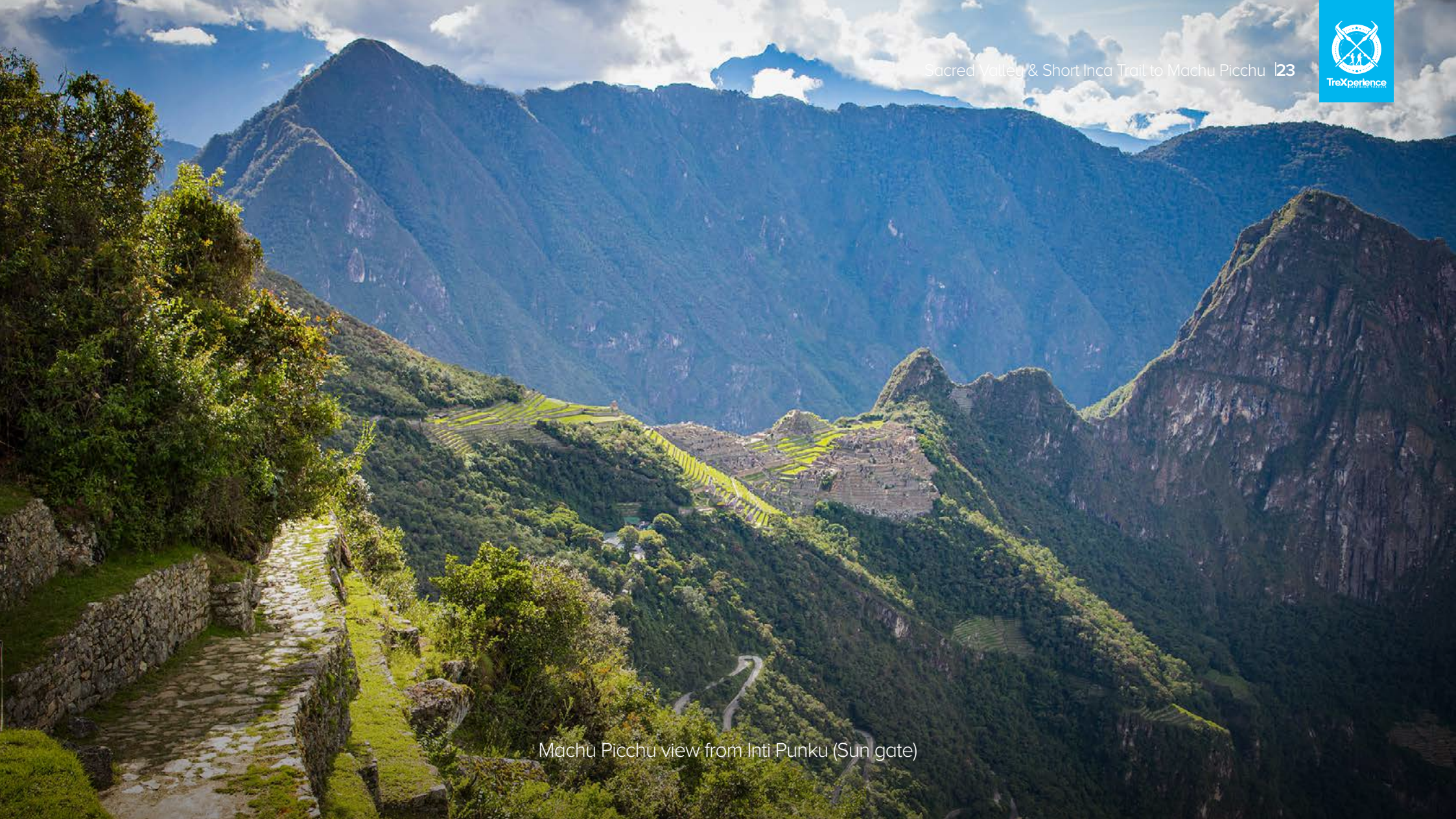
Machu Picchu view from Inti Punku (Sun gate)