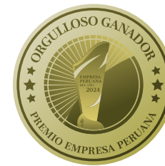
Empresa Peruana del año 2022