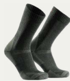
Trekking socks (4-5 pairs)

Comfortable, lightweight shoes to rest at camp.