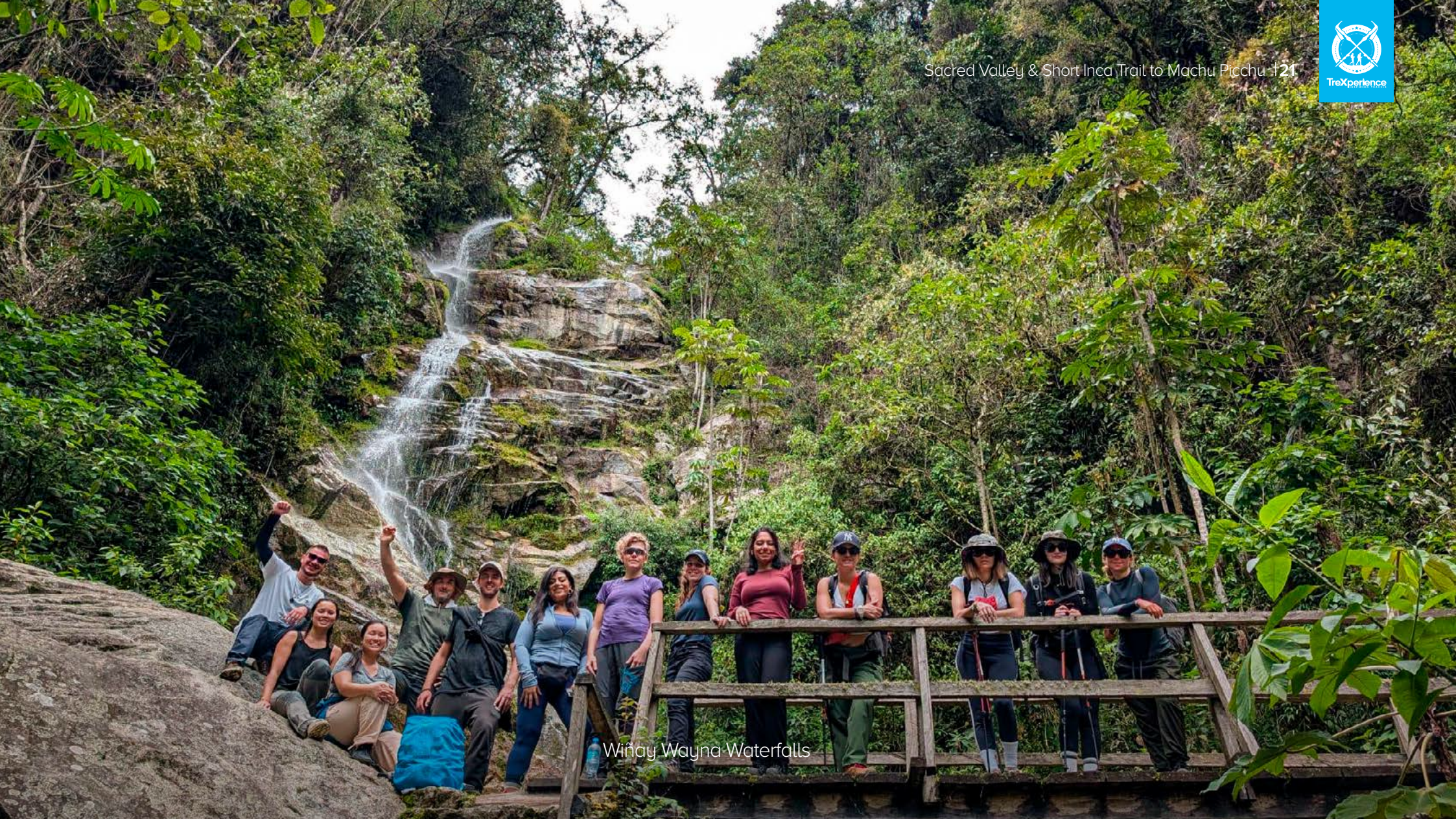
Winay Wayna Waterfalls