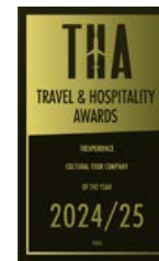
Travel & Hospitality Awards 2022