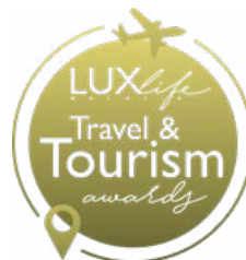
Lux Life Travel & Tourism 2022