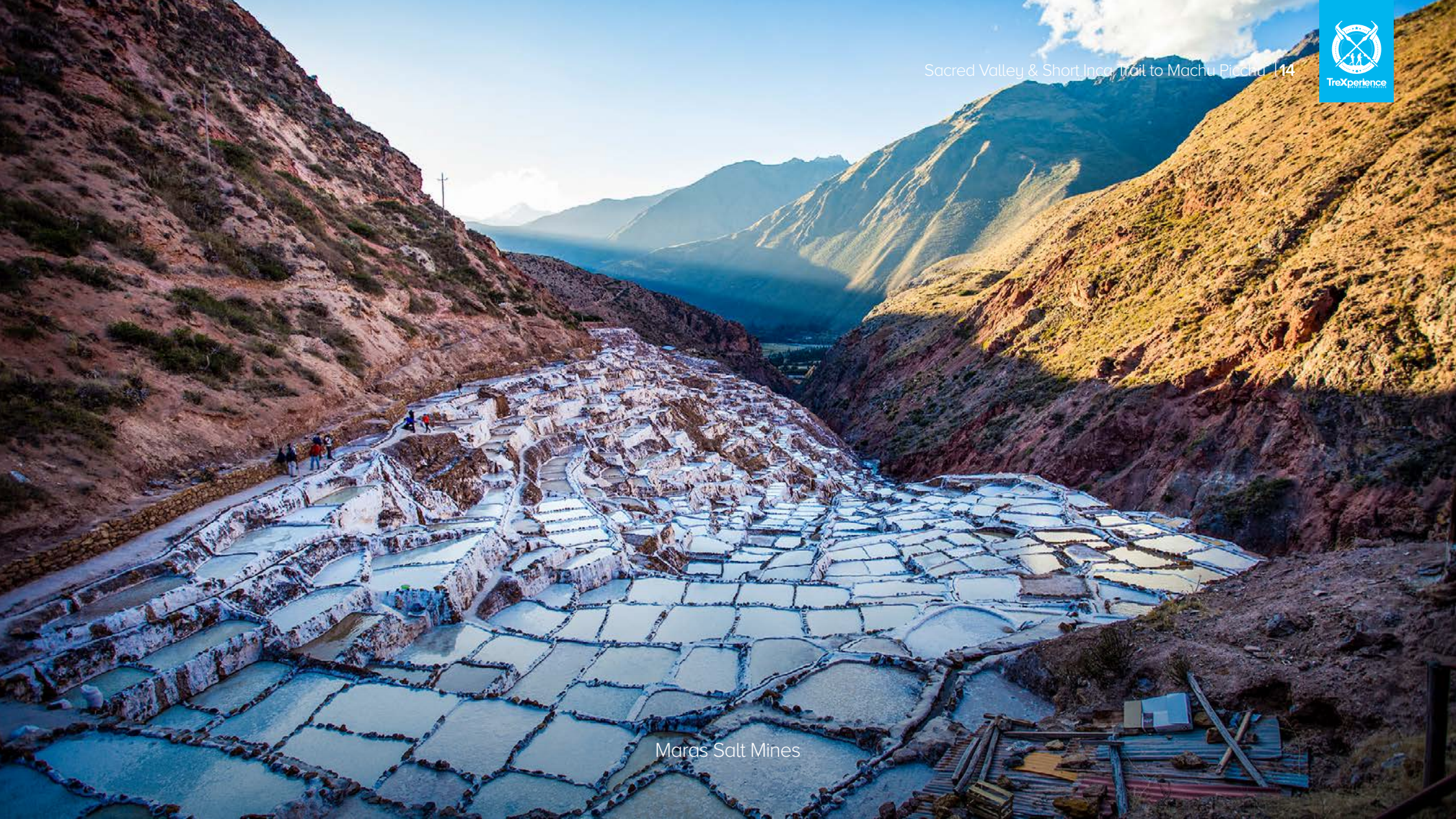
Maras Salt Mines