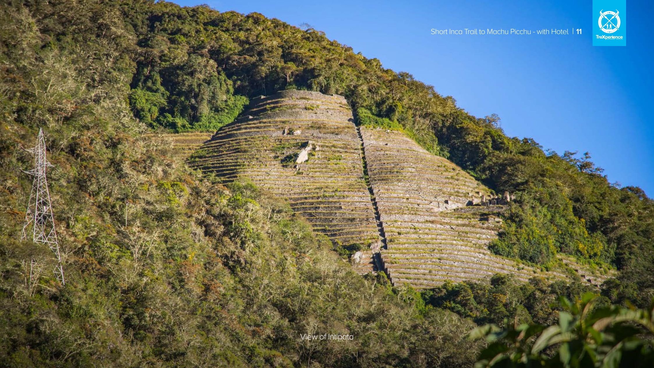
View of Intipata