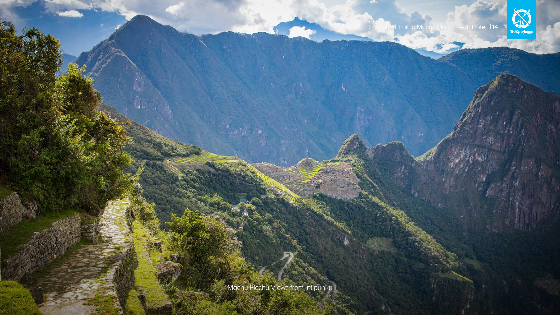
Machu Picchu Views from Intipunku