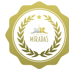
Premio Miradas 2022