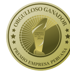
Empresa Peruana del año 2022