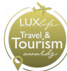
Lux Life Travel & Tourism awards 2022