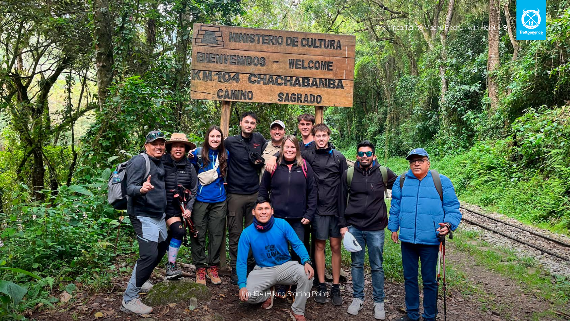
Km 104 (Hiking Starting Point)