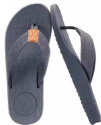
Sandals or lightweight shoes

Lightweight convertible pants for all weather.