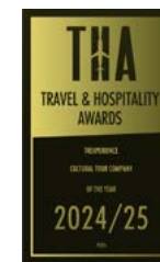
Travel & Hospitality Awards 2022