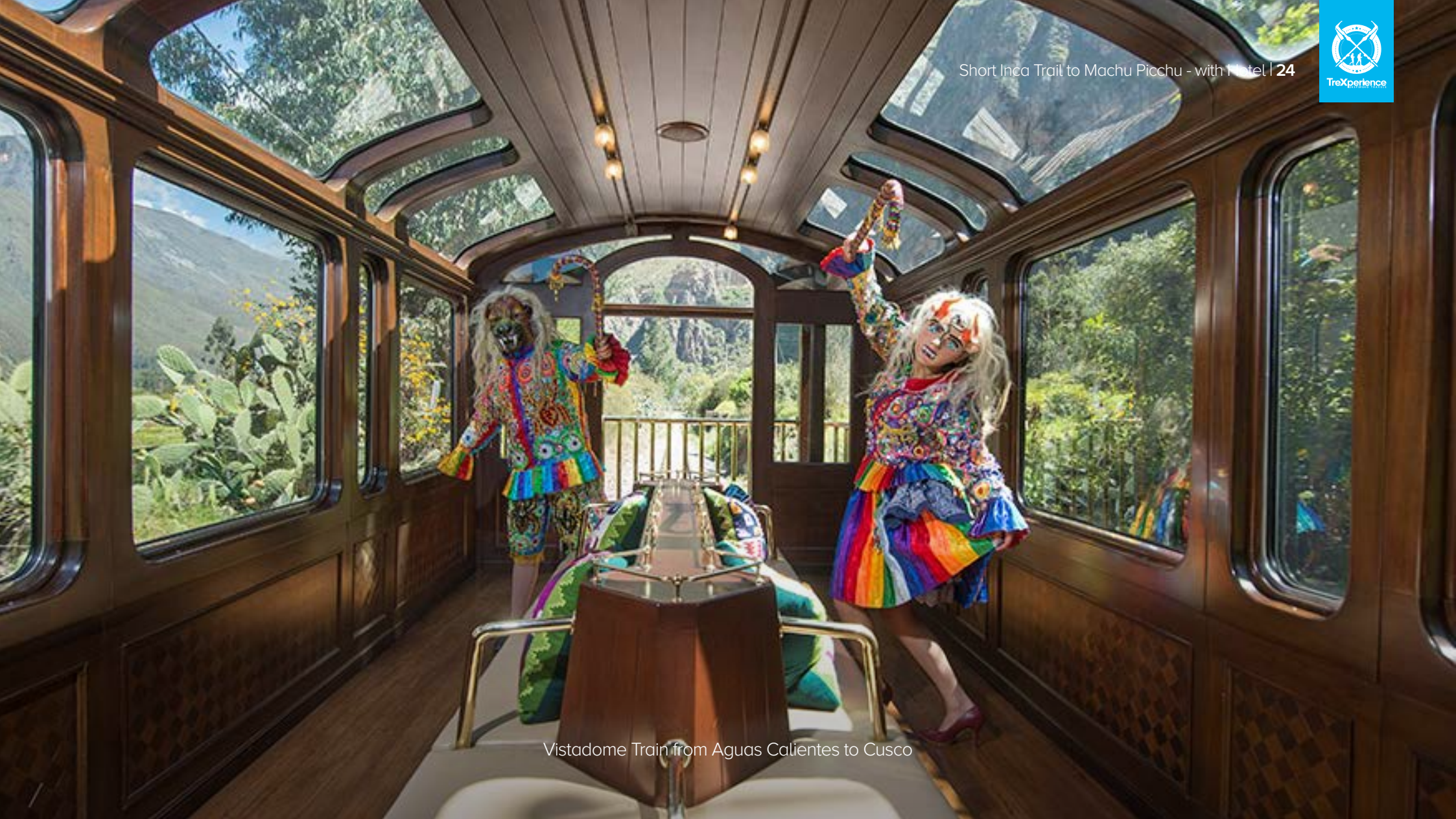
Vistadome Train from Aguas Calientes to Cusco